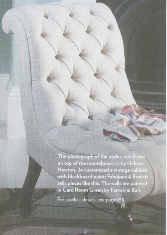
The photograph of the nudes, which sits on top of the mantelpiece, is by Helmut Newton. Jo customised a vintage cabinet with blackboard paint; Fabulous & French sells pieces like this. The walls are painted in Card Room Green by Farrow & Ball. For stockist details, see page 159